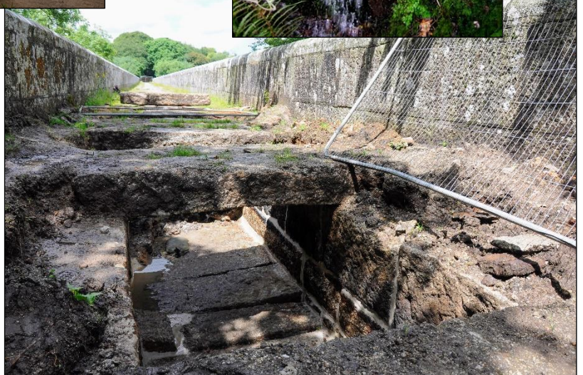
The Treffry Viaduct within the Luxulyan Valley