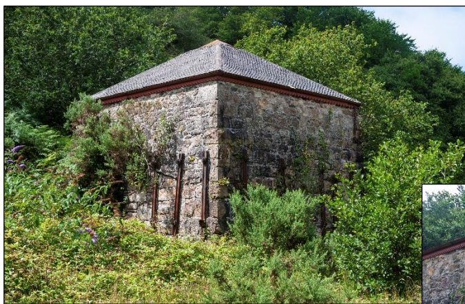
The Tolgus Calciner and Arsenic Works, near Redruth