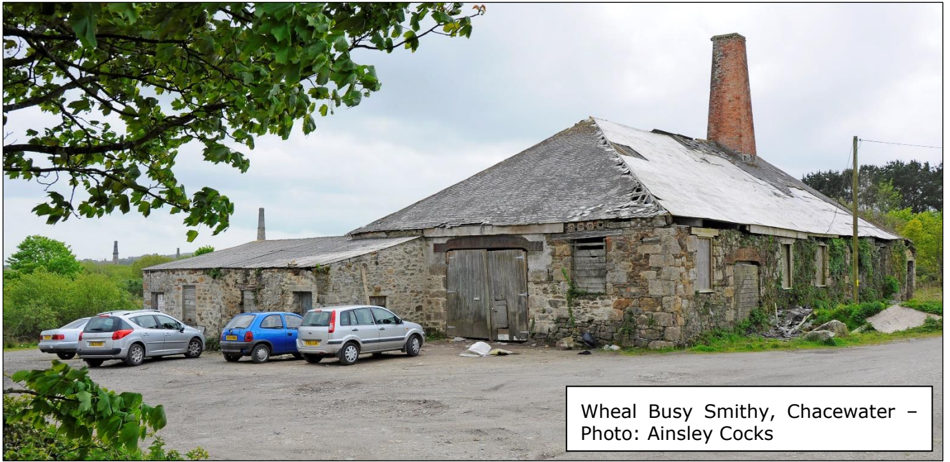
Wheal Busy Smithy, Chacewater