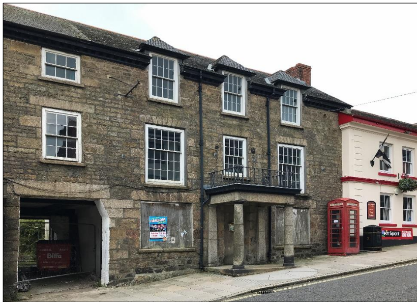
The Commercial Hotel, Fore Street, Redruth – Photo: Ainsley Cocks